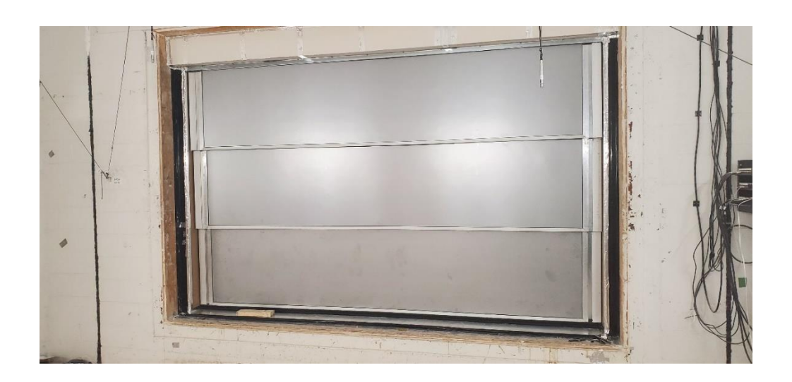
Figure 1: Wall Specimen

Proprietary details of the specimen are withheld from this report at the request of the client.